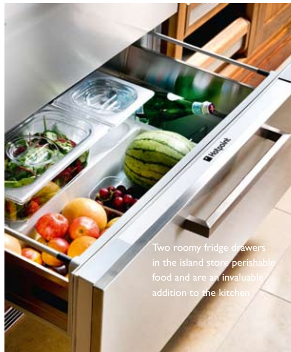
Two roomy fridge drawers in the island store perishable food and are an invaluable addition to the kitchen

'I believe that food brings families together,' she continues. 'Now that the room is complete, I think I'm going overboard making pasta, bread and preserves from scratch. My husband is enjoying all the fabulous meals and I never have a problem getting the children to sit up at the table.' BK